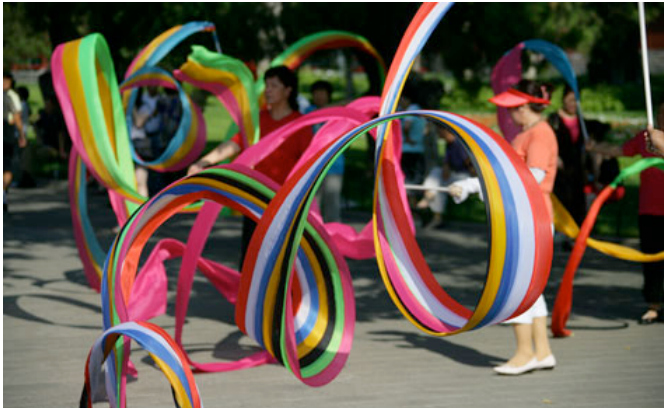
A still from artist Sarah Morris' latest film from her City Portraits series, 'Beijing'