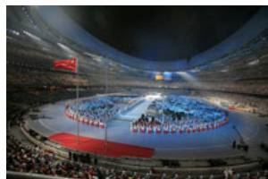
See some still's from Sarah Morris' latest film

Famed since the 1990s for her architecturally themed films as well as colourful, geometric abstract painting, it makes sense that the Architecture Foundation has teamed up with UK-born artist Sarah Morris (her strong graphic art was featured on Wallpaper's April 2009, W*121 cover) for the UK premiere of her new film, Beijing.